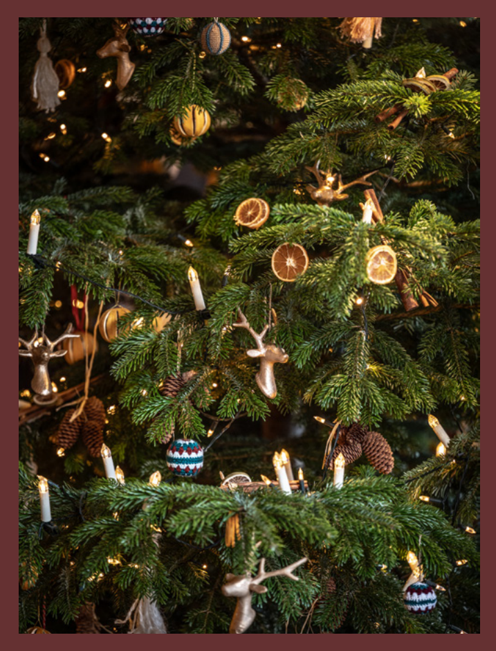
Festive Workshops at the Fife Arms