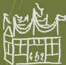
Highland Games Pavilion